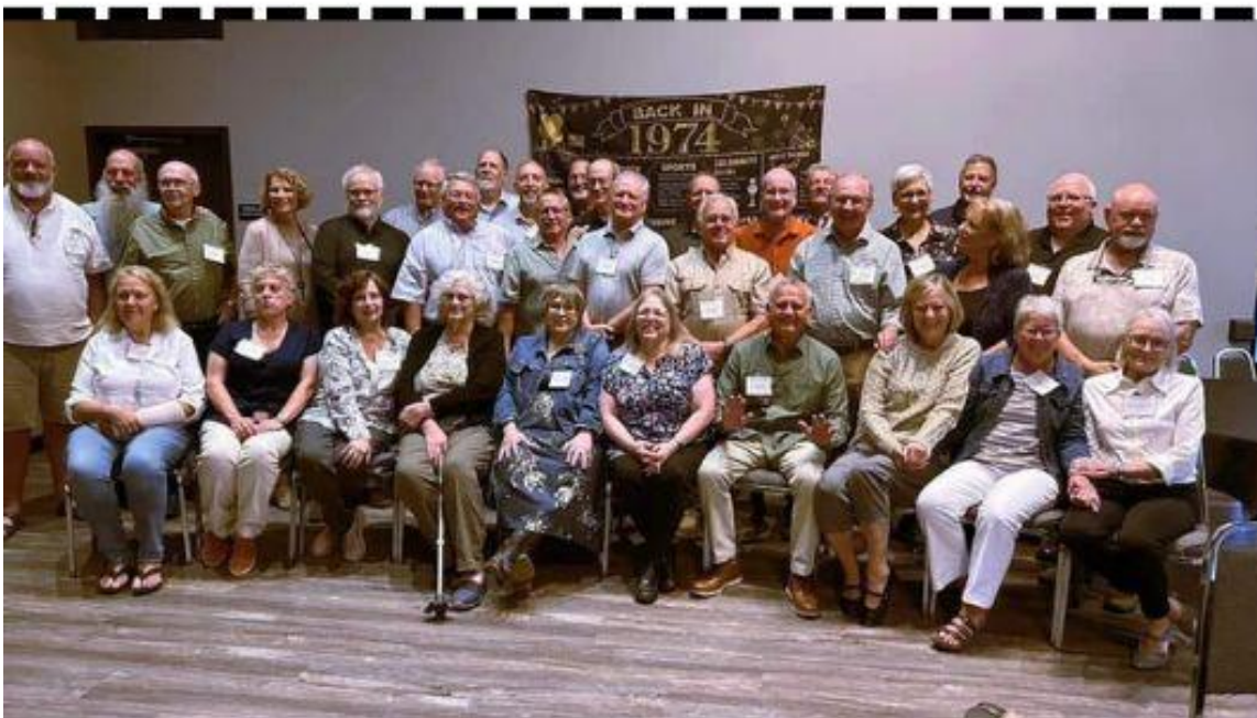
Class of 1974: 50 years