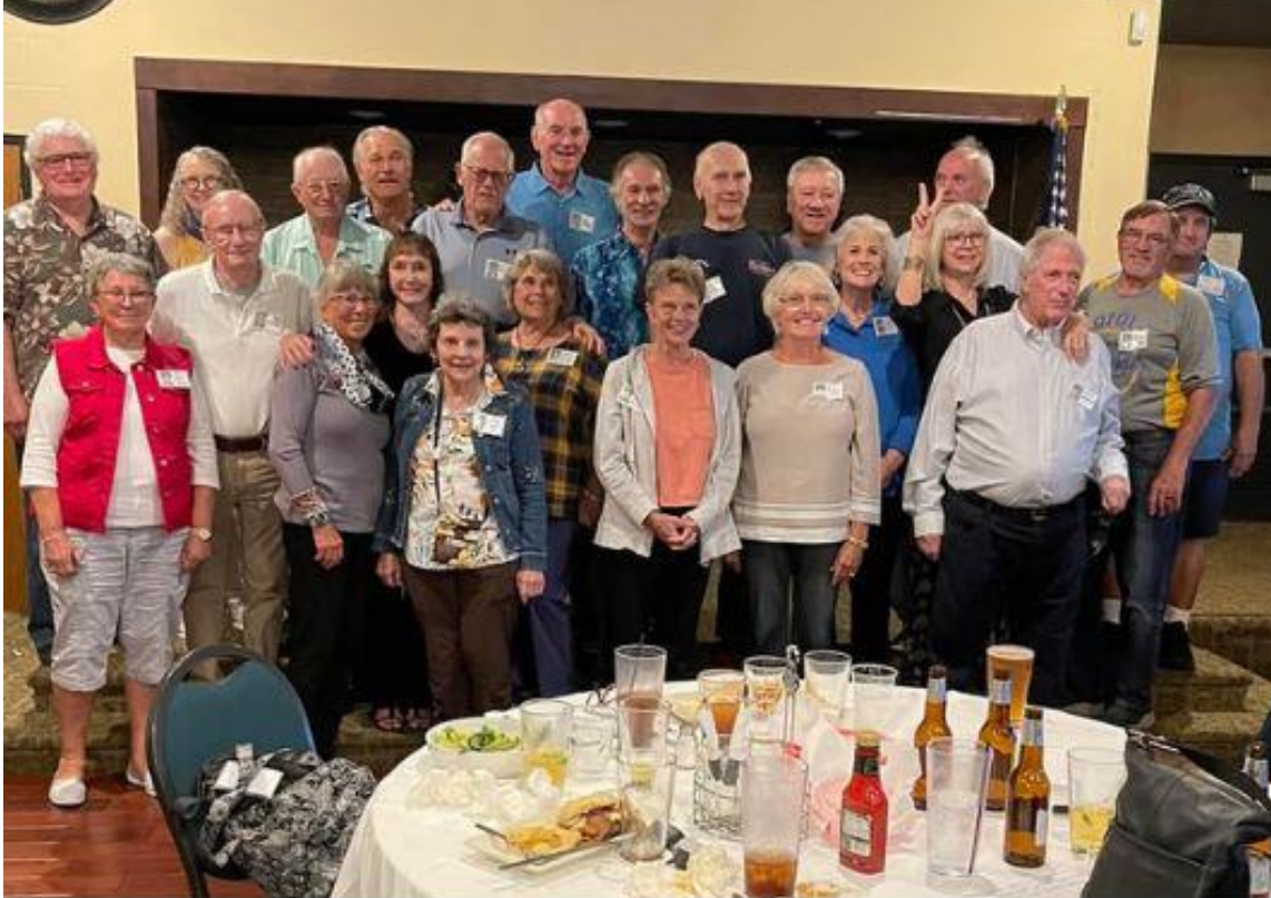
Class of 1967: 57 years