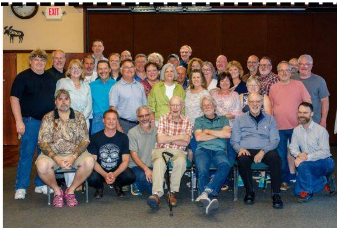
Class of 1984: 40 years