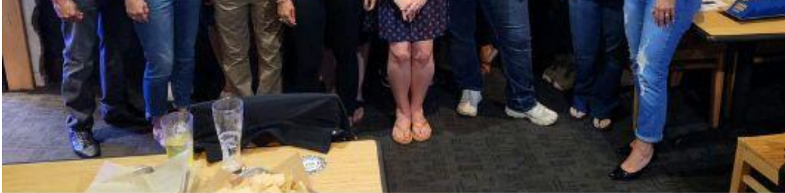
Class of 1999: 25 years