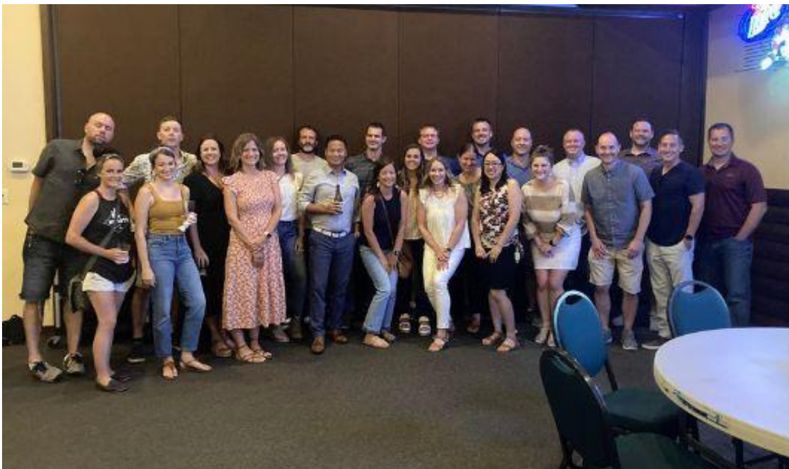
Class of 2002: 22 years

Additionally, we received a few photos from this year's reunions, which we've shared below. If you have photos you'd like to share with us, we'd love to see them!